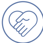
Recovery Community-based Services