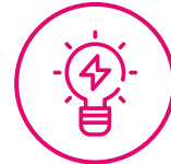
Projects & Campaigns